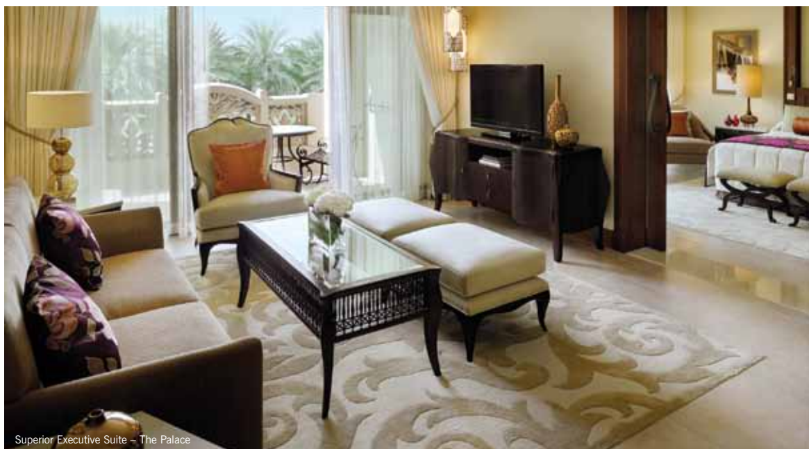
Superior Executive Suite – The Palace

Just steps away from the pristine beach, the villa features a private driveway entrance offering total security. Impeccably styled, two independent bedrooms of 70 and 100m 2 are separated by an elegant 'Arabesque' style lounge, dining room and entertainment area. An intimate shaded terrace opens to a private temperature-controlled swimming pool with gazebos.